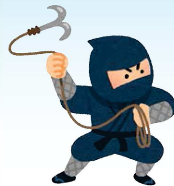
Typical style of Ninja in fiction stories

A Ninja was an agent who engaged in covert activities such as espionage, guerilla attacks and assassination in ancient Japan. Origin and history of Ninja are not known very well, however the Iga Ueno village you will visit today is considered the birthplace of the Ninja, where the art of the Ninja (Ninjutsu) had been secretly developed. For their secret art, people have seen Ninja as mysterious warriors and a lot of fiction stories have been created over time.