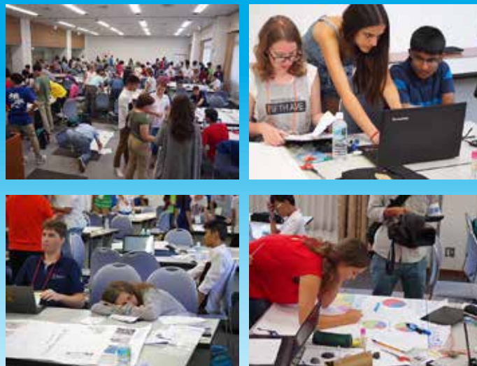
Clockwise from top left; preparation room in Mie University, making PowerPoint slides on PC, drawing a graph on the poster, exhausted student.

The students showed their great persistence and concentration on Friday in completing beautiful posters before deadline. However, the supervisors in Suzuka argued the importance of definite, consistent and well prepared instruction to make the projects fruitful.