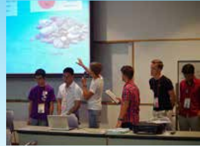
Clockwise from top left; oral presentation room, showing result of analysis, poster presentation in front of media, in front of jury, lobby poster session held.